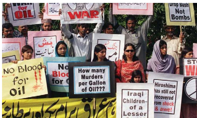
Not just radical Islamists: Pakistani nongovernmental organizations march against Iraq war.