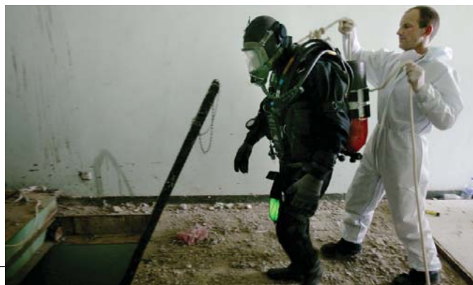
What happens if they come up empty? British divers inspect an underwater bunker in Basra.

T he Iraq war was the first application of the new theory that preventive war can be an effective instrument against the spread of nuclear, biological, and chemical weapons. “Prevention” invites a medical metaphor. And, indeed, observers often imagine an epidemic when they think of weapons of mass destruction proliferation. Yet the best metaphor for proliferation is a cancer that results from environmental causes and metastasizes in predictable patterns from cell to neighboring cell. China gets nuclear weapons, India responds to China, and then Pakistan to India. Israel builds nuclear weapons, then Iraq tries, along with Iran, even as the acquisi-