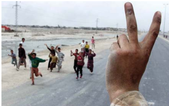
A brief, shining moment: British soldier greets Iraqi children in Basra, where coalition forces have had to fight crime and cholera.