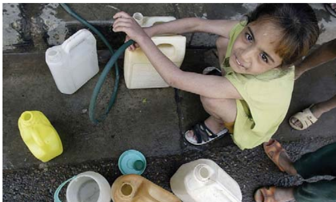
No democracy without water: Fetching a postwar drink in downtown Baghdad