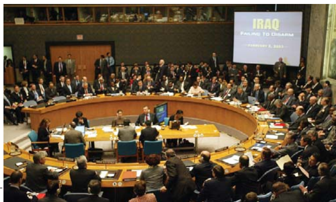
Multipolarity, European-style: The U.N. Security Council deliberates on Iraq.

Concerns over trans-Atlantic relations, American attitudes toward the United Nations Security Council, and the future of multilateralism stem from a single, overarching issue of the post-Cold War era: the issue of international legitimacy. When the United States wields its power, especially its military power, will world opinion and more importantly its fellow liberal democracies, especially in Europe, regard its actions as broadly legitimate? Or will the United States appear, as it did to many during the crisis in Iraq, as a kind of rogue superpower?