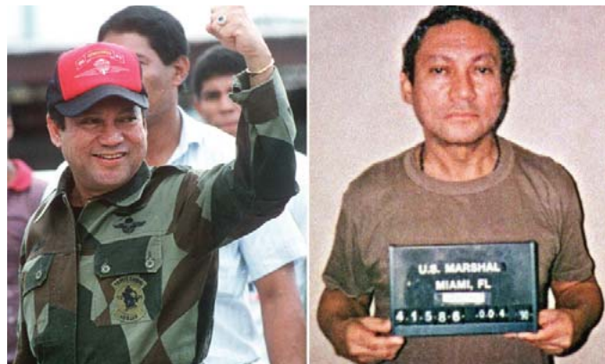
He didn't leave until U.S. troops came: Panamanian strongman Manuel Noriega, before and after the 1989 U.S. invasion of Panama.